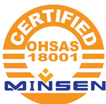
OHSAS 18001: 2007 Certification No. MS20xx3