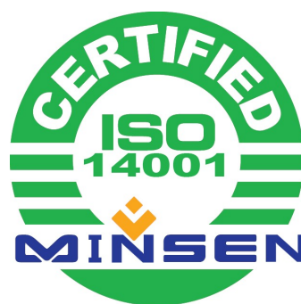
ISO 14001: 2015 Certification No. MS20xx2