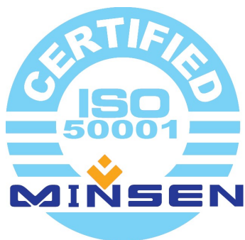
ISO 5000: 2011 Certification No. MS20xx4