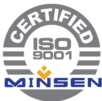
ISO 9001: 2015 Certification No. MS20xx1