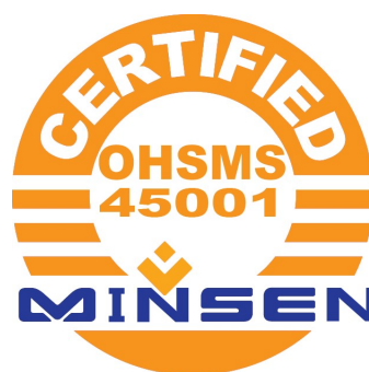
ISO 45001: 2018 Certification No. MS20xx3