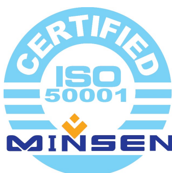
ISO 50001: 2018 Certification No. MS20xx4